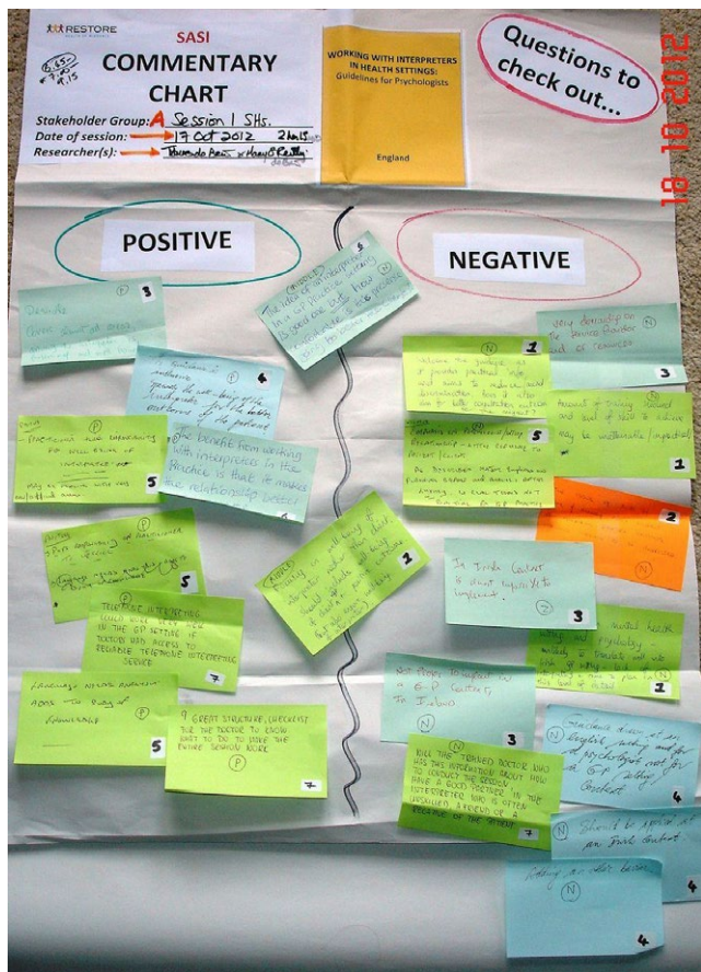
FIGURE 1 Commentary Chart—Ireland

(see Figure 1). For example, in Ireland, stakeholders met in one large group for each of five PLA sessions. They had identified a “local set” of five GTIs and co-generated five separate Commentary Charts. Where several stakeholder groups met separately (eg Austria) or were geographically dispersed (eg The Netherlands), charts were computerized and circulated around stakeholder groups by email, iteratively accruing additional data. On occasion, researchers took physical charts from one stakeholder group to the next, and data were added incrementally. As Commentary Charts “travelled” around stakeholder groups, the knowledge-exchange and knowledge-enhancing process continued.